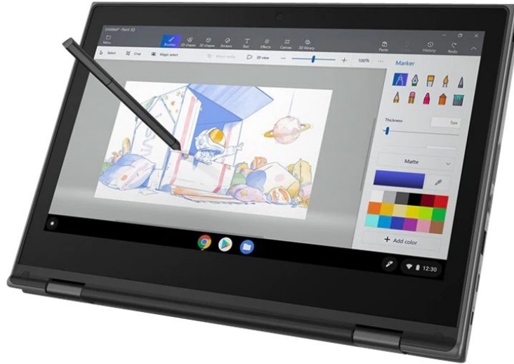
Lenovo 500e Chromebook