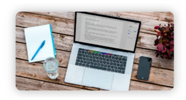
Support the Development of Digital Literacies

The use of the personal learning device for teaching and learning aims to: